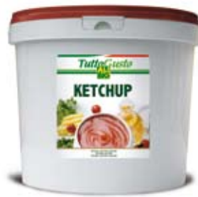
cod. 51969 BUCKET 5000g x 1 pcs.

An irreplaceable sauce to accompany fried-food or meat based dishes in the easy and capacious 5kg bucket.