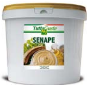
cod. 51966 BUCKET 5lt x 1 pcs.

A sauce with a sourish and slightly spicy taste, perfect to accompany meat barbecue.