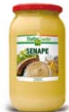
cod. 51965 JAR 1000g x 6 pcs.

Mustard in the typical glass jar, useful to prepare roll-breads and sandwiches, but ideal also to accompany wurstel and sauerkrauts.