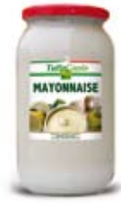
cod. 51961 JAR 1000g x 6 pcs.

The standard glass jar that contains a delicious sauce, perfect to prepare bread-rolls, sandwiches and to accompany many dishes.