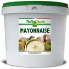
cod. 51960 BUCKET 5000g x 1 pcs.

The usual sauce to fill sandwiches or to accompany different dishes in the practical and capacious 5kg bucket.